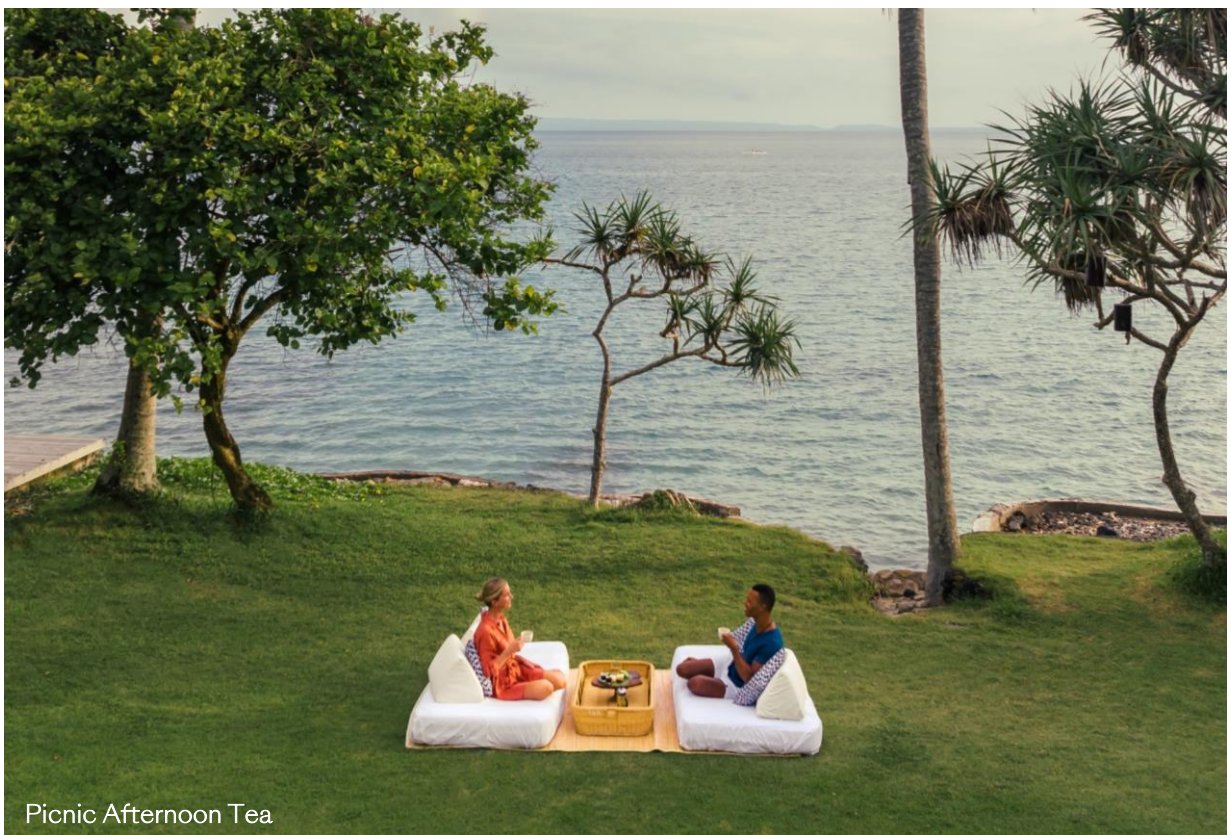
Picnic Afternoon Tea